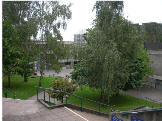
Campus at University of East Anglia

in", with session 1 of the meeting commencing at 11.30 am.